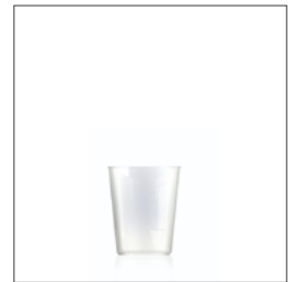
Glass of shot