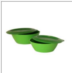
Box „Ecobox“ Size : 500 ml