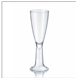
Glass of champagne