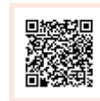
Formulaire en FR