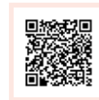
Formulaire en FR