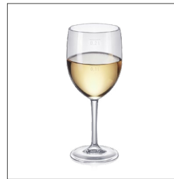
Glass of wine