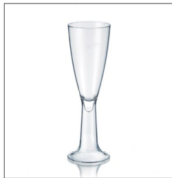
Glass of champagne