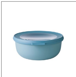
Box „Luloop“ Size : 750 ml