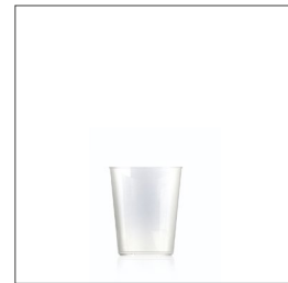
Glass of shot