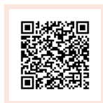
Formular auf DE