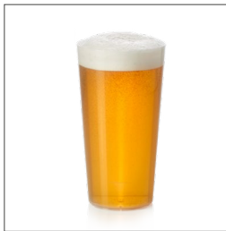
Cup of Soft / Beer Size : 0,3 litre

Gastronomic gear that can be borrowed against a deposit by the municipality within the limits of the available stock (please specify the quantity):