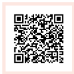
Formulaire en FR