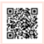
Formulaire en FR

By filling in and returning this form, you consent to the use of your personal data for the purpose of your application for a "Subsidy Application - Cost of living allowance."