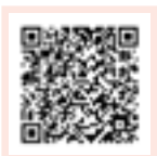
Formular auf DE