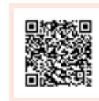
Formulaire en FR