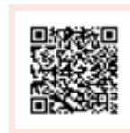
Formular auf DE

(for minors: also have signed by a parent)