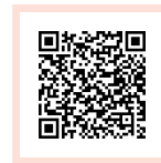
Formulaire en FR