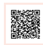
Formulaire en FR