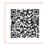
Formulaire en FR